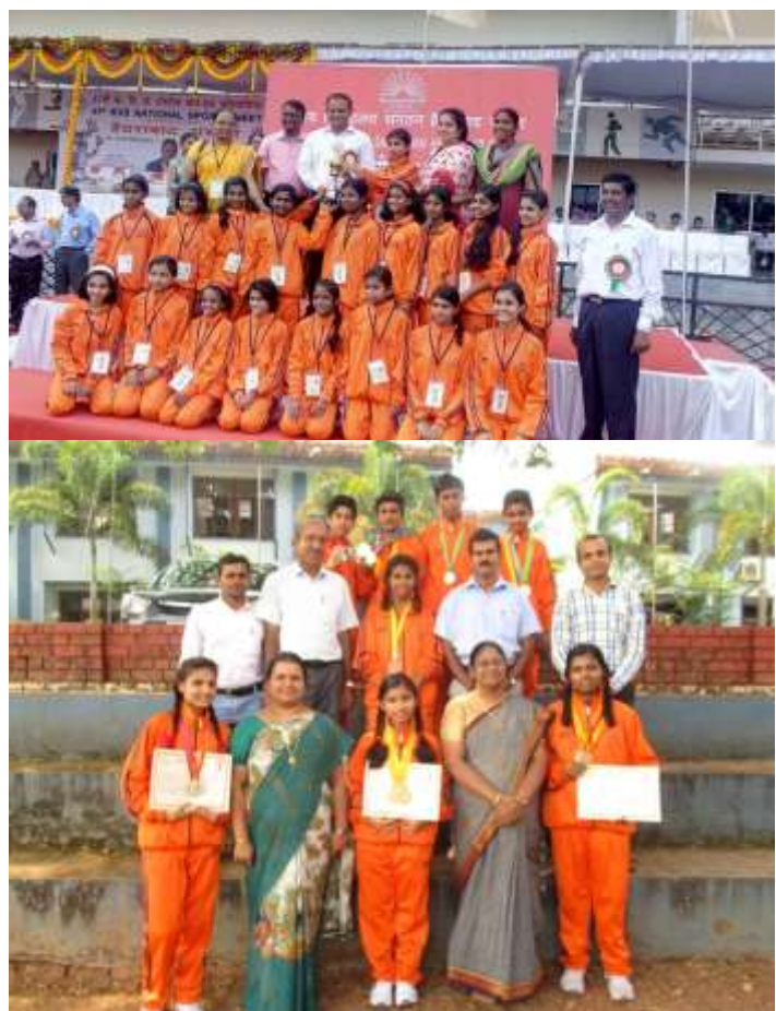
IN 15th NATIONAL OLYMPIAD WINNERS