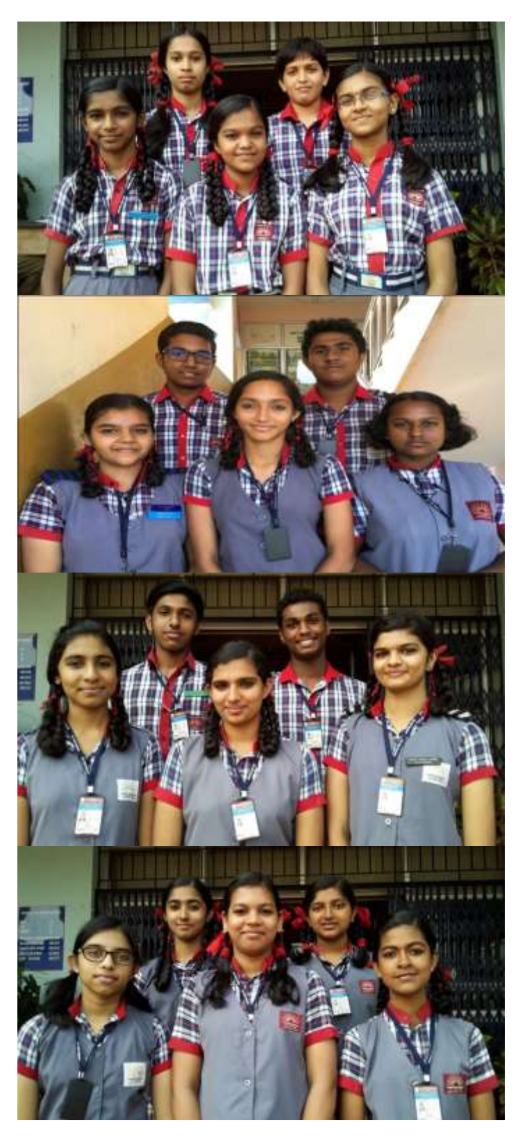
STUDENT ACHIEVERS IN SPORTS 2016-17